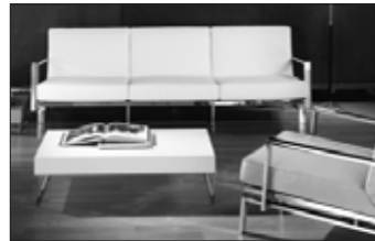
Rezone8 living furniture on "CSI-Miami."

Rezon8 Living (7900 Haskell Ave, Van Nuys) will add modern style to the new season of CSI: Miami . Sleek sofas, metal and chrome tables and floor lamps are among the store's classically designed pieces that will appear on the CBS show. The home furnishing haven presents its Fall Tent Event October 6-7, 9am to 6pm, with savings up to 70 percent on select floor samples. www.rezon8living.com .